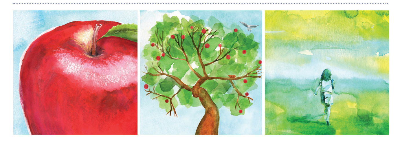
SDTC: Where did the impetus to write 'Where Are You Now?' come from?

TCB: I started thinking about my mother in a new way as the tenth anniversary of her death approached.